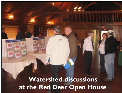
Watershed discussions at the Red Deer Open House

The State of the Watershed Technical Advisory Committee and the Steering Committee met in late November to finalize a methodology for measuring and summing up health and/or risk. The health summaries will be included in the next draft which is due to the RDRWA from the consultant on December 15. The final roll out of the report will be in the spring of 2009.