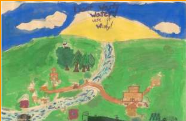
Winning Poster 2007-2008